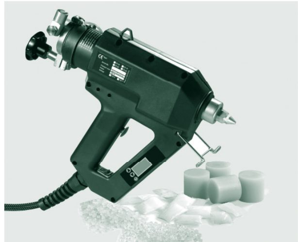
Hand gun for bead applications