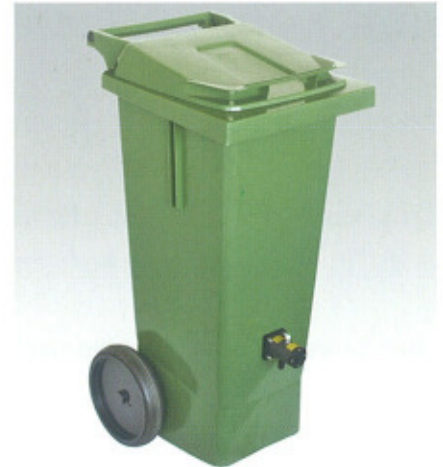
Container with optional vibrator