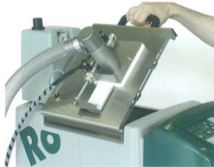
Automatic switching-off in case of open tank lid