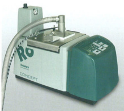
Direct activation by the basic appliance

The suction tube is inserted in the container holding the adhesive granulate. The integrated venturi generates a negative pressure with the effect that the granules are attracted and fed. The shaking device fitted to the suction tube supports the suction process. In case of a very sticky granulate, feeding can be further optimized by means of an additional optional vibrator at the container.