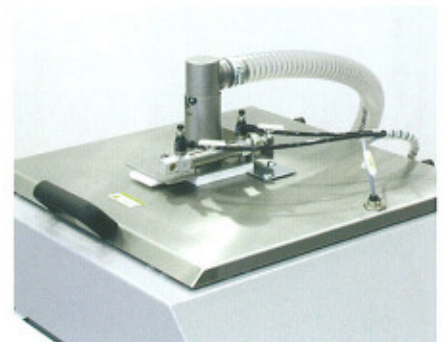
A slide prevents the escape of vapours and the clogging of the feed opening